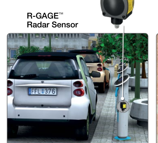
Radar sensors detect both moving and stationary objects, regardless of shape or color, with weather immunity algorithms.

Solution: Wireless communication relays information from sensors to update the number of open parking spots