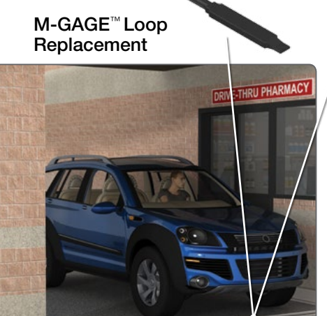
Parking occupancy sensors use magnetoresistive technology to sense large ferromagnetic objects, and are easily buried in the ground or mounted on top of the road surface in a lowprofile dome.