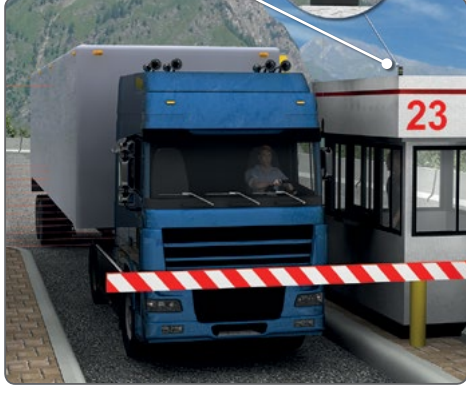
Signal lights provide high intensity light and visibility for signalling and traffic management control.