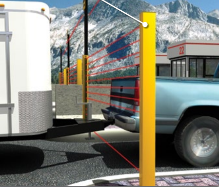
Measuring light curtains sense the profile of vehicles and small parts, such as tow bars, and detect vehicle separation.